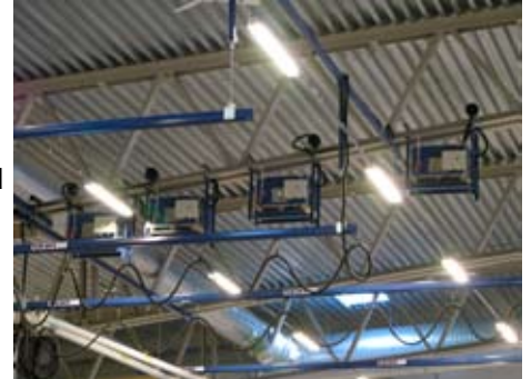
Detail from ceiling, pump stations in a row.

A service agreement is included in the installation.