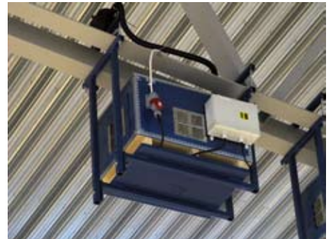
Each station is clearly marked (on the remote control receiver) to facilitate service.